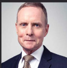
Lieutenant General David Morrison AO 2016 Australian of the Year

Join us for Australia's most inspiring annual gathering of community sector workers, volunteers and supporters, bringing together stellar speakers and delegates to listen, debate, network and - perhaps most importantly - recharge.