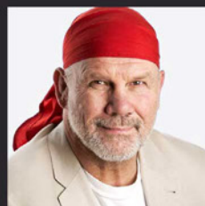
Peter FitzSimons National Chair, Australian Republican Movement